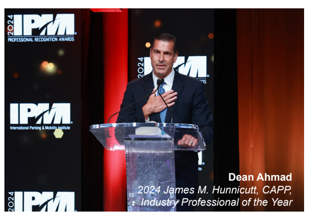
Continued Page 12