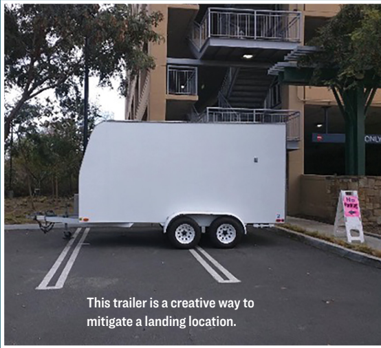
This trailer is a creative way to mitigate a landing location.