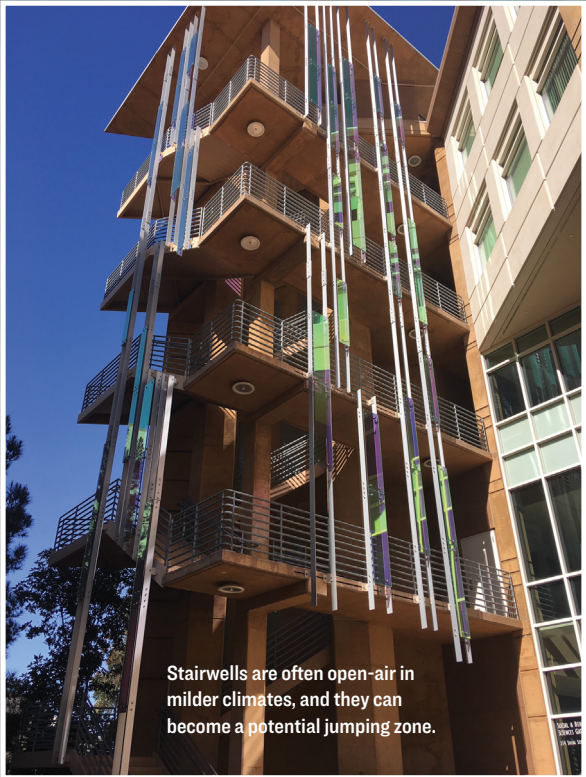
Stairwells are often open-air in milder climates, and they can become a potential jumping zone.