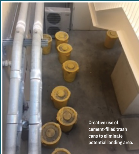
Creative use of cement-filled trash cans to eliminate potential landing area.