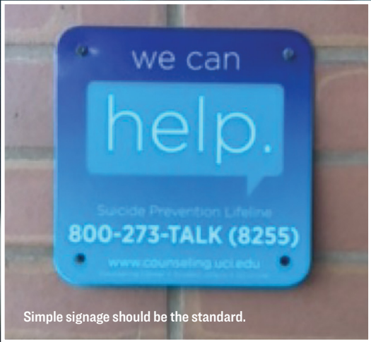
Simple signage should be the standard.