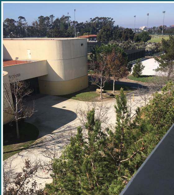
Greenery planted next to a garage offers a visual barrier for someone thinking of jumping.

We all learn from each other in this area. Here's a 10-step list to help your organization mitigate garage suicides and stay up-to-date with best practices: